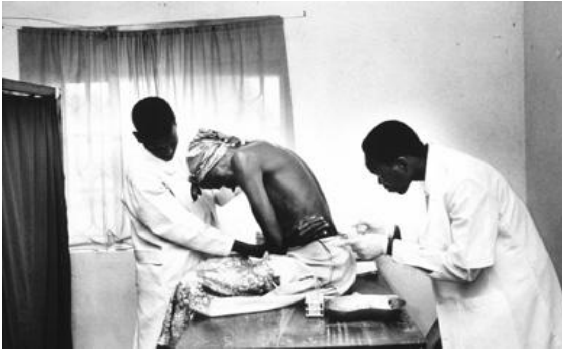
Lumbar puncture being carried out on the patient.